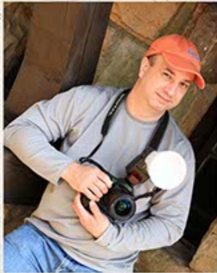
Photo Production Services

PHOTOGRAPHY THAT PLEASES THE CLIENT IS IMPORTANT- BUT ARE YOU CREATING WORK THAT PLEASES YOU?